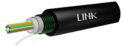
OUTDOOR/INDOOR, Armored, Single Tube UFCX3XXA