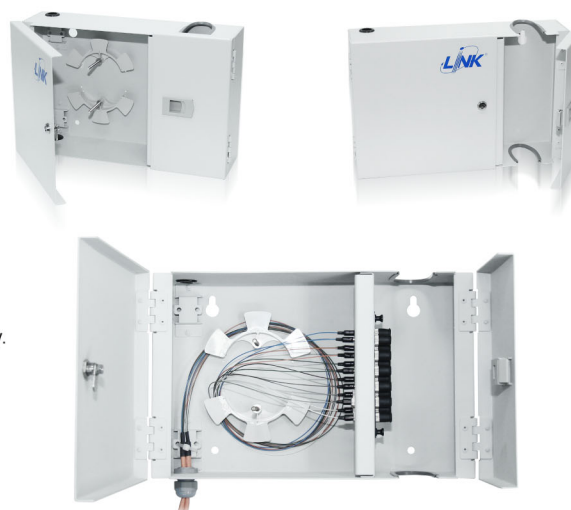
WALL MOUNT ENCLOSURE