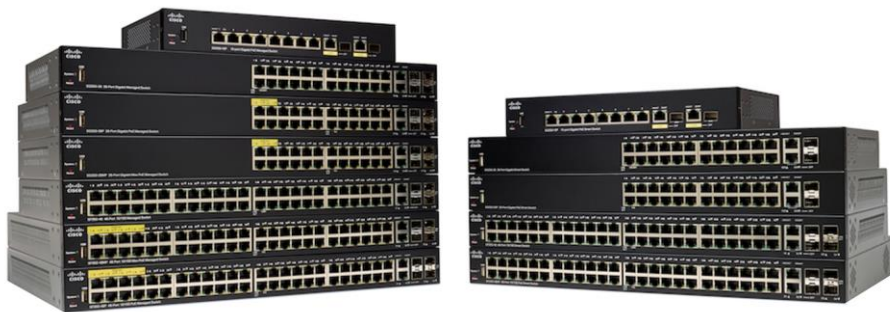
Figure 1. Cisco 250 Series Smart Sw itches

The Cisco 250 Series is the next generation of affordable smart switches that combine powerful network performance and reliability with a complete suite of the network features you need for a solid business network. These powerful Fast Ethernet or Gigabit Ethernet switches, with Gigabit or 10 Gigabit Ethernet uplinks, provide multiple management options, sophisticated security capabilities, fine-tuned Quality-of-Service (QoS) and Layer 3 static routing features far beyond those of an unmanaged or consumer-grade switch, at a lower cost than for fully managed switches. And with an easy-to-use web user interface, Smart Network Application, and Power over Ethernet Plus (PoE+) capability, you can deploy and configure a complete business network in minutes.