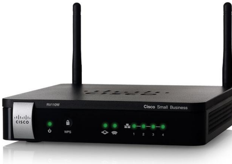
Figure 1. Cisco RV110W Wireless-N VPN Firewall

The Cisco® RV110W Wireless-N VPN Firewall provides simple, affordable, highly secure, business-class connectivity to the Internet for small offices/home offices and remote workers.