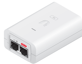
POE-24-24W-G-WH POE-48-24W-WH POE-48-24W-G-WH