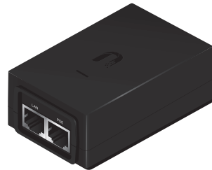
POE-24-24W POE-24-24W-G POE-24-30W