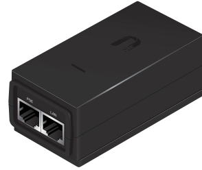
POE-15-12W POE-24-12W POE-24-12W-G