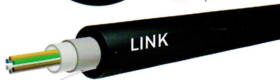
OUTDOOR/INDOOR, Single Tube UFCX3XX