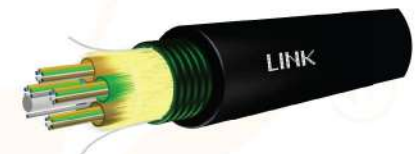
OUTDOOR/INDOOR, Armored, Multi Tube UFCX3XXMA