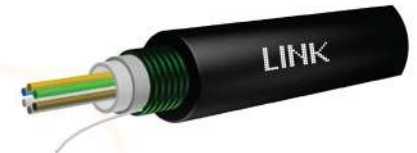
OUTDOOR/INDOOR, Armored, Single Tube UFCX3XXA