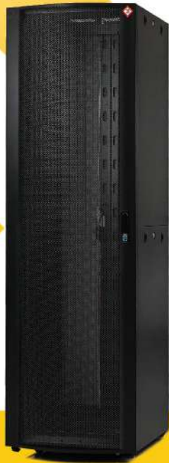
Single Front Door