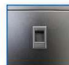
Slide Latch w/logo