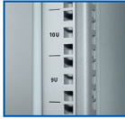
Mounting Pole w/screen UH