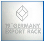
Front Door w/logo