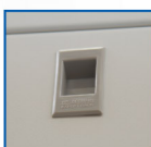
Slide Latch w/logo