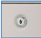
Security Cam Locks