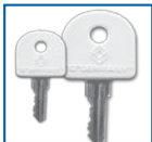
Master Key w/logo