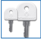
Master Key w/logo