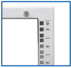
Mounting Pole w/Screen UH