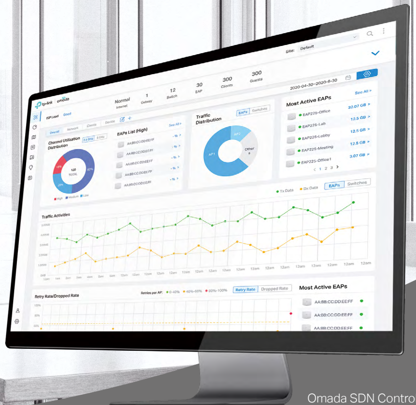
Omada SDN Controller

EAP690E HD / EAP670 / EAP660 HD / EAP653 / EAP650 / EAP620 HD / EAP613 / EAP610 / EAP265 HD / EAP245 / EAP225 / EAP223 / EAP115 / EAP110 / EAP655-Wall / EAP650-Wall / EAP615-Wall / EAP235-Wall / EAP230-Wall / EAP225-Wall / EAP115-Wall / EAP650-Outdoor / EAP610-Outdoor / EAP225-Outdoor / EAP110-Outdoor