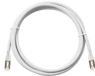
Ex. US-5201SLZ-1 : Shield CAT6A RJ45 to RJ45 Patch Cord, LSZH, White, 1 meter

Standard : ANSI/TIA-568.2-D Category 6A, ISO/IEC 11801:2017 Class EA, Application : 10/100/1000 BASE-T, 2.5G/5G, 10G BASE-T, IEEE 802.3i/u/ab/bz/an, PoE/PoE+, 4/16 Token Ring, 52/155/622Mbps and 1.2Gbps ATM, ISDN, VoIP and other Cable : Stranded wire flexible S/FTP category 6A performance Flame rating : LSZH Color : White, Aqua blue (Available color on request) Connector : Category 6A RJ45 modular plug with over 50 micro-inches gold plating Wire Size : 26 AWG Cover Boot : Transparent boot from manufacturer are designed to protect plugs and cables Q.C. : 100% factory assembly and testing Approvals : Intertek Channel Test Certified : Lead-free & RoHS Compliant