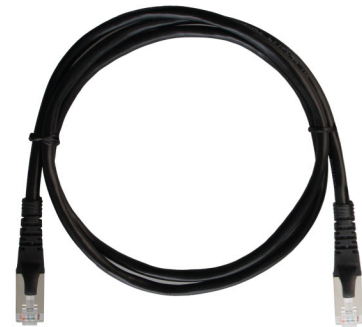
Shield CAT5E RJ45 to RJ45 Patch Cord