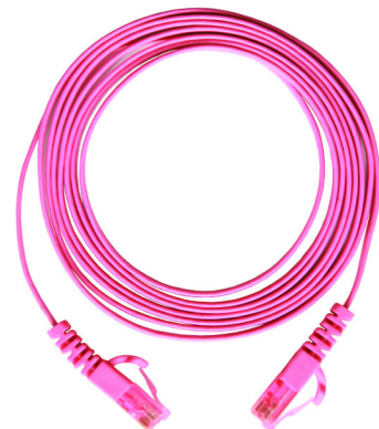
FLAT CAT5E RJ45 to RJ45 Patch Cord